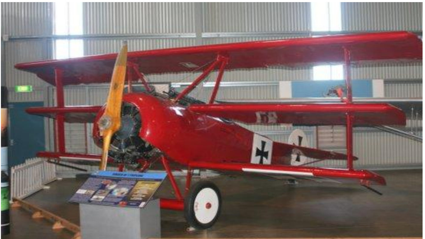
Baron Von Richthofen's Fokker DR1 Triplane

Two aircraft included in the museum are not pasted operational types used, but are there because of their significance to the Army's history. The first is a replica of a Fokker DR1 Triplane that was flown by Baron Von Richthofen. Much is covered on the Baron's demise and the role the Aussies were reputed to have played in his final down fall.